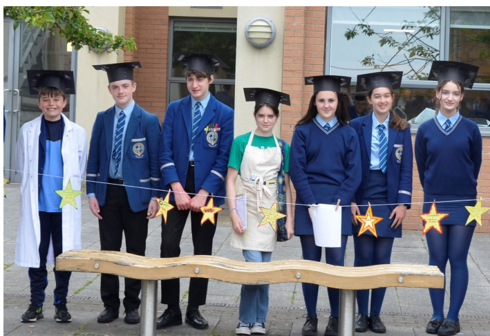
Our school football teams enjoyed the most successful season in over 25 years. Our Careers department, in conjunction with Queen's University Belfast, organised a "Mini-versity" experience for Year 9 pupils.